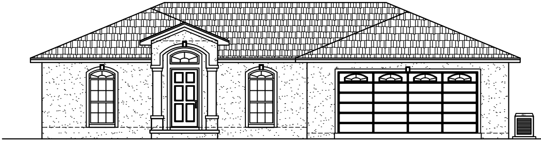
THE DANE (54'-0"W X 61'-8"D) © COPYRIGHT TRINITY DRAFTING LLC