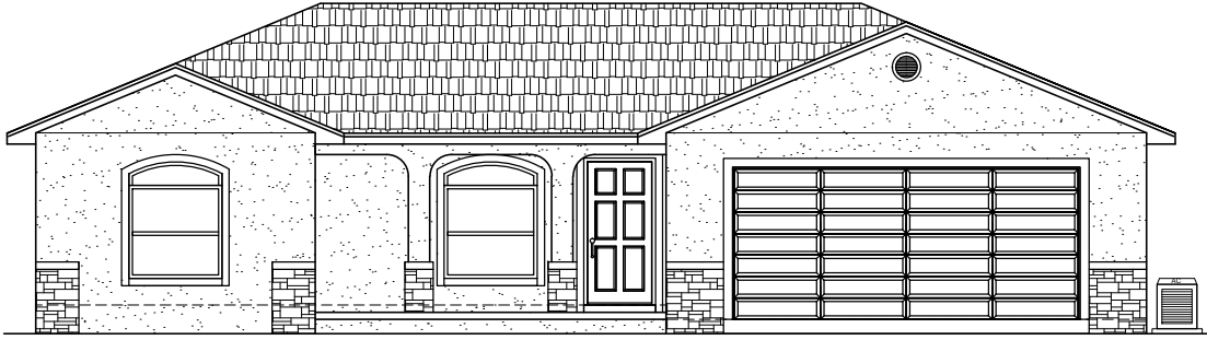
THE NAPLES (51'-8"W X 48'-0"D) © COPYRIGHT TRINITY DRAFTING LLC